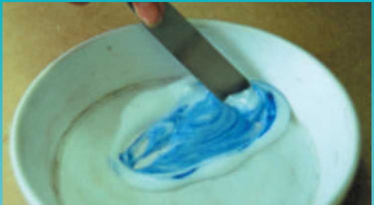
Actual colours may differ slightly as their pigments can be difficult to recreate in print

High quality acrylic paint with superior colour saturation and covering power